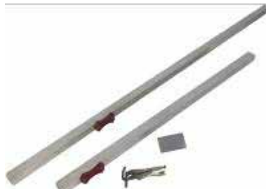
Test Bars & Tools