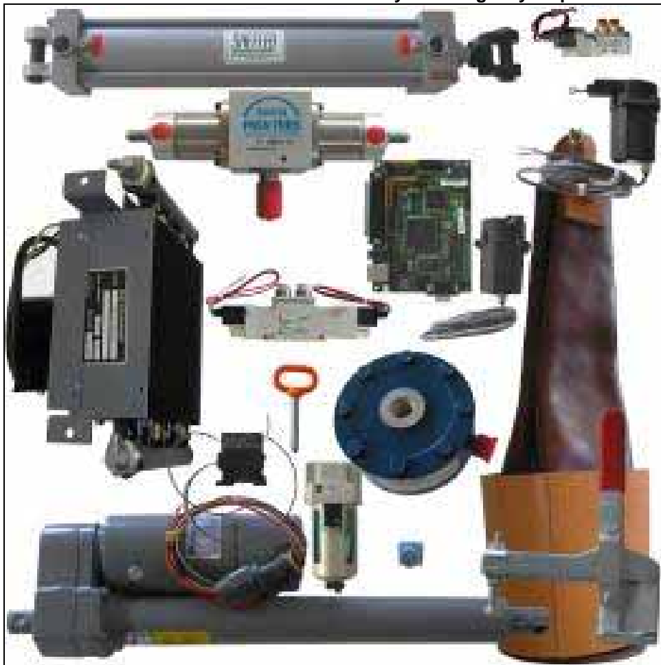
A small sample of stock parts for Metriguard Panel Testers Model 820 & 830

You can buy your parts with a credit card at Metriguard. Call 509-332-7526 to place your order. Parts in stock ship within 2 business days. Emergency shipments same day.